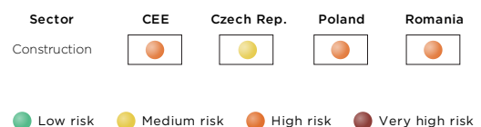
CHART 4 Coface Sector Risk Assessments – Q2 2018

The supportive situation on the CEE labour market with all-time low unemployment rates and an ongoing growth of wages contributed to accelerating turnover of trade companies. Nevertheless, this increased demand cannot completely counteract the significant competition which is affecting the sector's margins. Smaller entities in particular find it more difficult to be as competitive as their larger counterparts, which are able to benefit from their stronger capabilities for negotiation. The retail and wholesale sectors are still widely represented in insolvency statistics. They constitute above 30% of total insolvencies in Lithuania, Croatia, and Russia. On the other hand, there are a high number of trade businesses in the CEE region, and when taking all active companies into account, insolvency rates in the trade sector have not become alarming. Retail and wholesale insolvencies mostly concern smaller entities. As confirmed by the latest Coface CEE Top 500 Ranking 11 , the turnover of the largest businesses in the sector rose by 10%. However, the pressure on margins was also experienced here as net profits decreased by 6.7%.